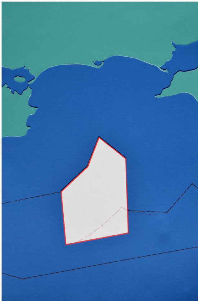
JOHN LAMBON'S GRAPHIC OF THE 76 SQUARE MILE SITE FOR NAVITUS BAY