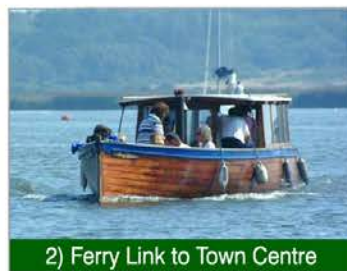
2) Ferry Link to Town Centre