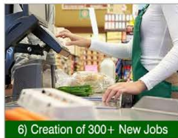
6) Creation of 300+ New Jobs