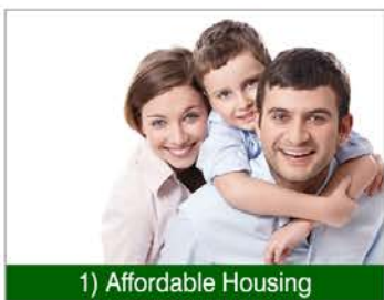
1) Affordable Housing