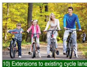
10) Extensions to existing cycle lane