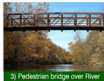
3) Pedestrian bridge over River