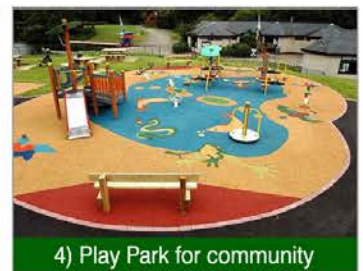
4) Play Park for community