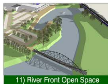
11) River Front Open Space