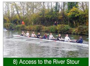
8) Access to the River Stour