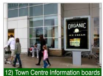
12) Town Centre Information boards