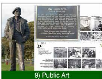
9) Public Art