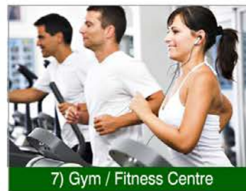
7) Gym / Fitness Centre